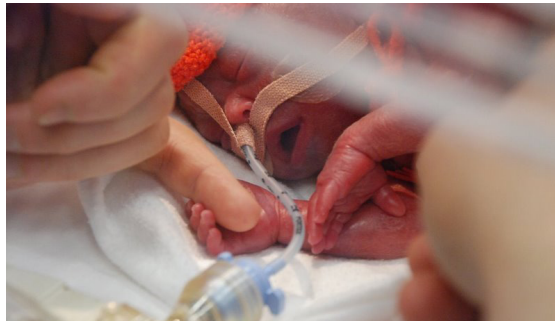
Extremely preterm infant.

tained from the parents of each child before or shortly after delivery. The study was funded by a grant from the Elsass Foundation.