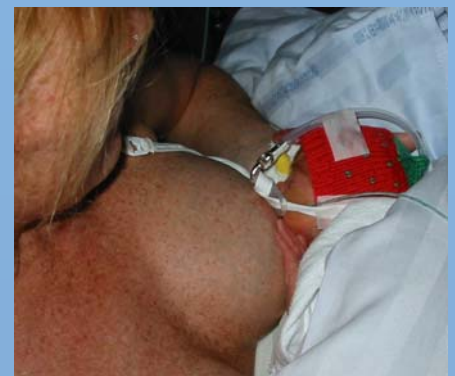
Premature girl GA 26+5, PMA 27+3, 775 grams. Second breastfeeding experience