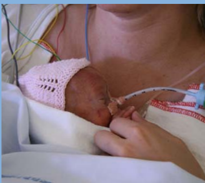
Premature girl GA 24+1, PMA 26+3, 680 grams. Skin-to-skin for 6½ hours this day

69 - 78% are exclusively breastfed at discharge (PMA 37-40 weeks) (2005 and 2004)